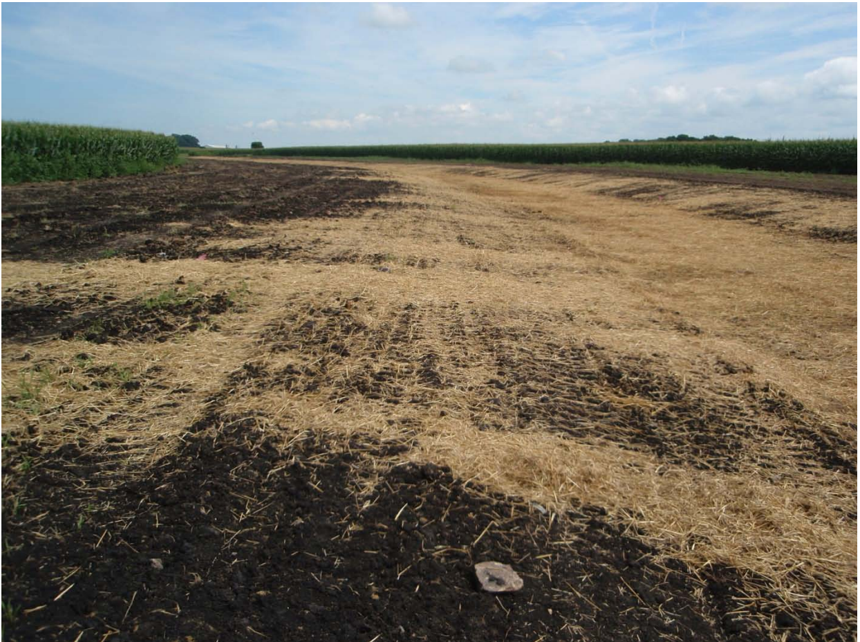
New Construction and Mulching of a Grassed Waterway